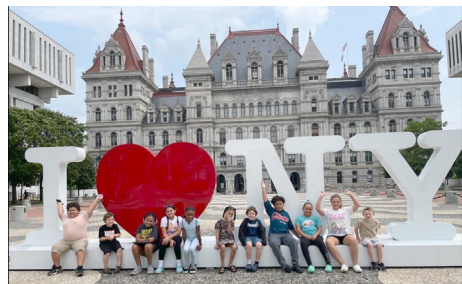
Fun moments like this one at Albany's Empire State Plaza.

for their generous support of our Traveling Summer Camp. Hundreds of children enjoyed fun day trips throughout the Capital Region over 6 weeks of summer. The children had a blast!